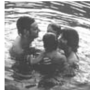
ORGANIC FAMILY “FRESH SQUEEZED” IMAGE