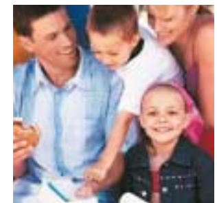
COMMERCIAL FAMILY “TANG™” IMAGE